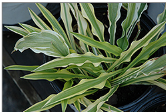
Alakazaam Hosta foliage

Other Names: Alakazam Hosta, Plantain Lily, Funkia