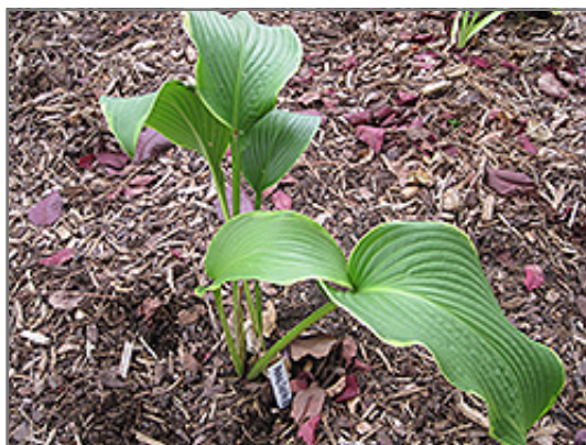
Abba Dabba Hosta