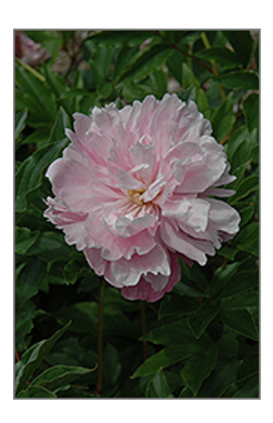
Duke of Devonshire Peony flowers

Duke of Devonshire Peony will grow to be about 30 inches tall at maturity, with a spread of 3 feet. When grown in masses or used as a bedding plant, individual plants should be spaced approximately 30 inches apart. The flower stalks can be weak and so it may require staking in exposed sites or excessively rich soils. It grows at a slow rate, and under ideal conditions can be expected to live for approximately 20 years. As an herbaceous perennial, this plant will usually die back to the crown each winter, and will regrow from the base each spring. Be careful not to disturb the crown in late winter when it may not be readily seen!