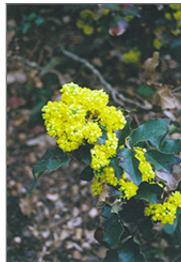
King's Ransom Oregon Grape flowers