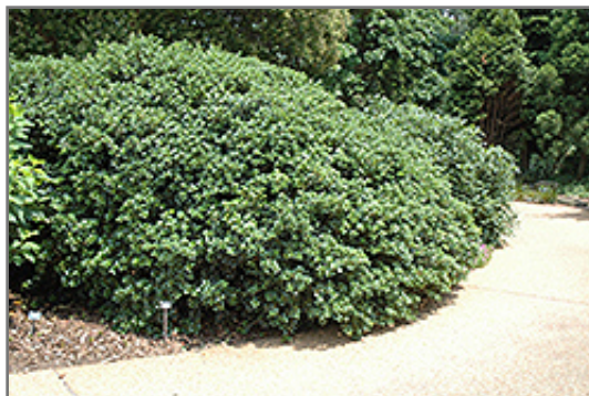
Roundleaf False Holly

Roundleaf False Holly is recommended for the following landscape applications;