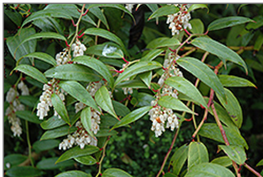
Keiskei Fetterbush in bloom

Keiskei Fetterbush is recommended for the following landscape applications;