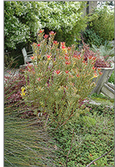
Safari Sunset Conebush

Safari Sunset Conebush makes a fine choice for the outdoor landscape, but it is also well-suited for use in outdoor pots and containers. Its large size and upright habit of growth lend it for use as a solitary accent, or in a composition surrounded by smaller plants around the base and those that spill over the edges. It is even sizeable enough that it can be grown alone in a suitable container. Note that when grown in a container, it may not perform exactly as indicated on the tag - this is to be expected. Also note that when growing plants in outdoor containers and baskets, they may require more frequent waterings than they would in the yard or garden.