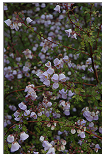
Violet Jovellana flowers