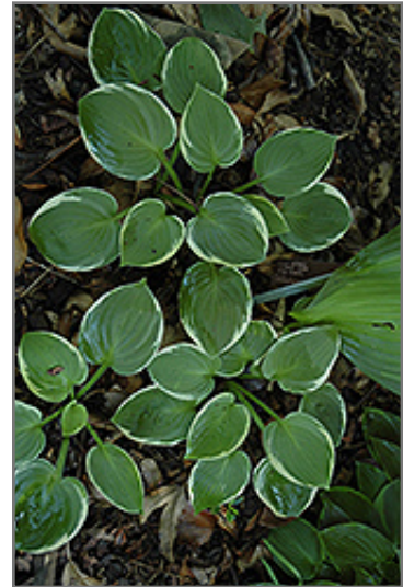
Moon River Hosta foliage