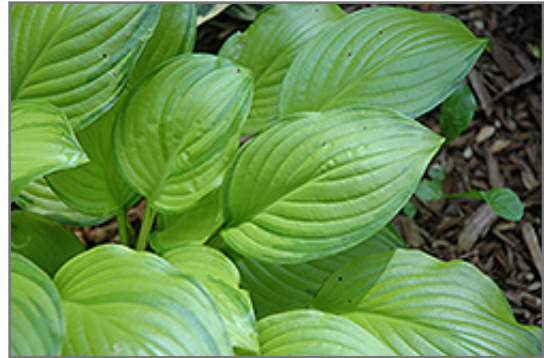
Hoosier Harmony Hosta foliage

This garden illuminating variety displays shiny chartreuse foliage with dark green defining margins; provides texture and spectacular contrast to other plants; near white spikes of flowers in mid to late summer