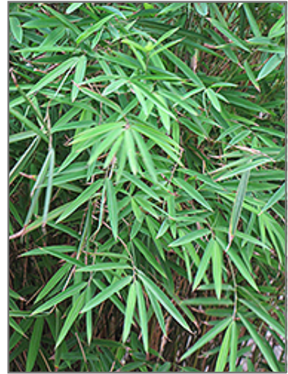
Blue Stemmed Bamboo foliage

This plant does best in partial shade to shade. It requires an evenly moist well-drained soil for optimal growth. It is not particular as to soil type or pH. It is somewhat tolerant of urban pollution, and will benefit from being planted in a relatively sheltered location. This species is not originally from North America. It can be propagated by division.