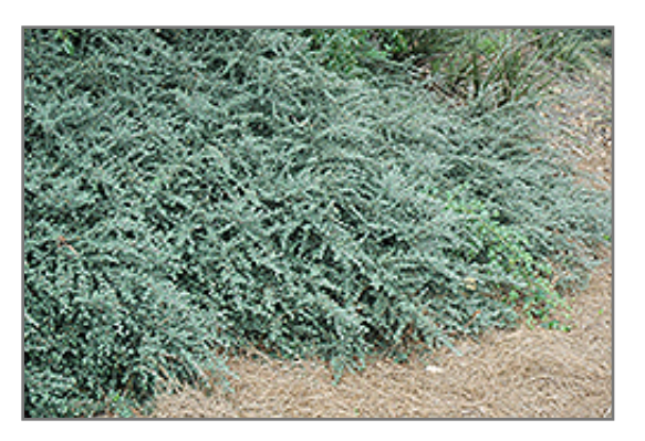
Gray Leaf Cotoneaster

Gray Leaf Cotoneaster will grow to be about 4 feet tall at maturity, with a spread of 6 feet. It tends to fill out right to the ground and therefore doesn't necessarily require facer plants in front. It grows at a fast rate, and under ideal conditions can be expected to live for approximately 30 years.