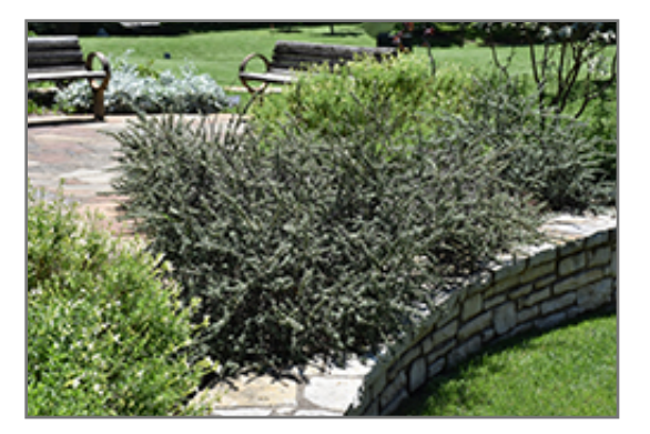
Gray Leaf Cotoneaster

This shrub will require occasional maintenance and upkeep, and should not require much pruning, except when necessary, such as to remove dieback. It is a good choice for attracting birds to your yard, but is not particularly attractive to deer who tend to leave it alone in favor of tastier treats. Gardeners should be aware of the following characteristic(s) that may warrant special consideration;