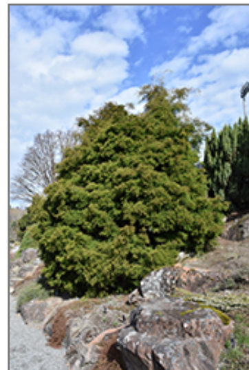
Coralliformis Dwarf Hinoki Falsecypress