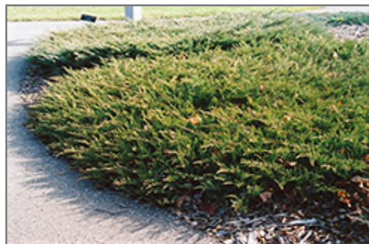
Prairie Elegance Juniper