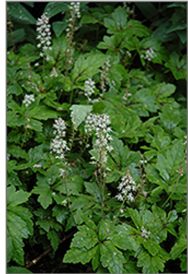
Crow Feather Foamflower flowers

A lovely low maintenance plant that is known for its tidy foliage and masses of springtime blooms; great for the woodland garden with its foliage shapes and colors; an excellent companion for many shade tolerant plants