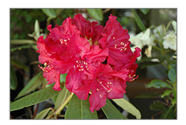
Red Brave Rhododendron flowers