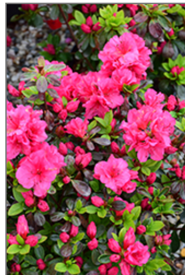
Jeremiah Azalea flowers