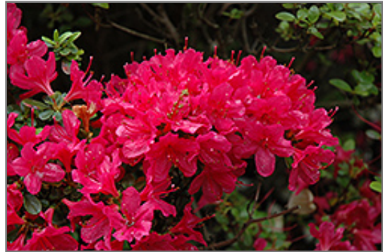
Hino Crimson Azalea flowers

This shrub does best in full sun to partial shade. It requires an evenly moist well-drained soil for optimal growth, but will die in standing water. It is very fussy about its soil conditions and must have rich, acidic soils to ensure success, and is subject to chlorosis (yellowing) of the foliage in alkaline soils. It is somewhat tolerant of urban pollution, and will benefit from being planted in a relatively sheltered location. Consider applying a thick mulch around the root zone in winter to protect it in exposed locations or colder microclimates. This particular variety is an interspecific hybrid.