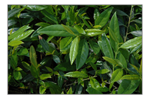
Zabel's Cherry Laurel foliage