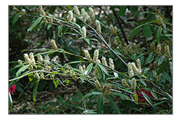
Zabel's Cherry Laurel flowers

Zabel's Cherry Laurel is recommended for the following landscape applications;