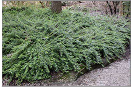
Privet Honeysuckle

This shrub does best in full sun to partial shade. It does best in average to evenly moist conditions, but will not tolerate standing water. It is not particular as to soil type or pH, and is able to handle environmental salt. It is highly tolerant of urban pollution and will even thrive in inner city environments. This species is not originally from North America.