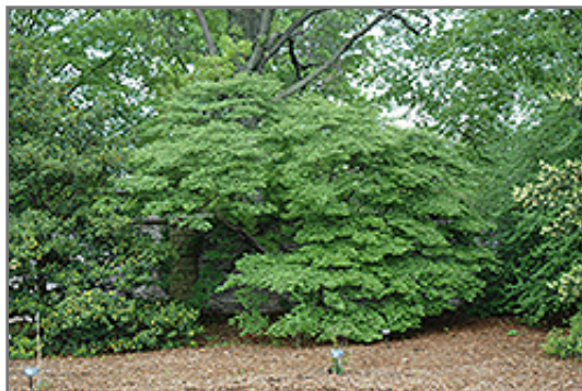
Autumn Glow Winterberry Holly

This shrub does best in full sun to partial shade. It prefers to grow in moist to wet soil, and will even tolerate some standing water. It is very fussy about its soil conditions and must have rich, acidic soils to ensure success, and is subject to chlorosis (yellowing) of the foliage in alkaline soils. It is somewhat tolerant of urban pollution. Consider applying a thick mulch around the root zone in winter to protect it in exposed locations or colder microclimates. This particular variety is an interspecific hybrid.