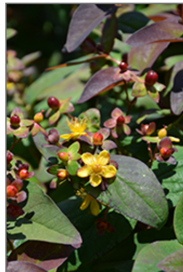
Albury Purple St. John's Wort flowers