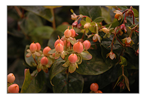
Mystical Beauty St. John's Wort fruit