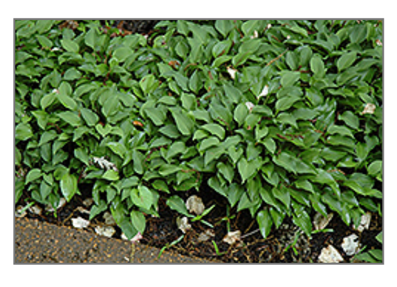
Hime Soules Hosta