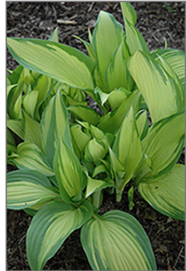
Choko Nishiki Hosta foliage