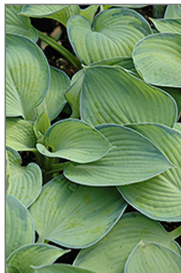
Bright Lights Hosta foliage