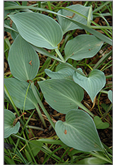
Blueberry Tart Hosta foliage