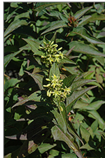
Butterfly Southern Bush Honeysuckle flowers

Butterfly Southern Bush Honeysuckle is recommended for the following landscape applications;