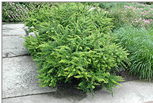
Sparkle Japanese Barberry

Sparkle Japanese Barberry is recommended for the following landscape applications;