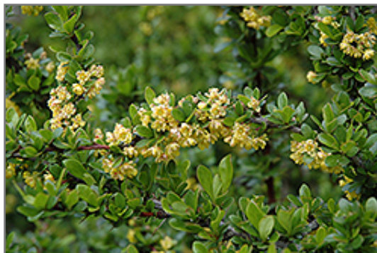
Sparkle Japanese Barberry flowers

This shrub does best in full sun to partial shade. It is very adaptable to both dry and moist growing conditions, but will not tolerate any standing water. It is considered to be drought-tolerant, and thus makes an ideal choice for a low-water garden or xeriscape application. It is not particular as to soil type or pH, and is able to handle environmental salt. It is highly tolerant of urban pollution and will even thrive in inner city environments. This is a selected variety of a species not originally from North America.