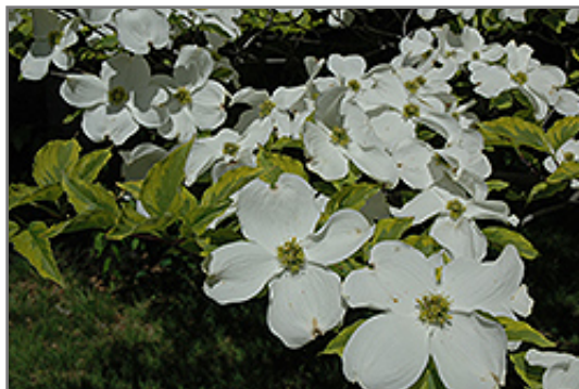
Rainbow Flowering Dogwood flowers

This is a relatively low maintenance tree, and should only be pruned after flowering to avoid removing any of the current season's flowers. It is a good choice for attracting birds to your yard. Gardeners should be aware of the following characteristic(s) that may warrant special consideration;