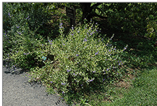
Worcester Gold Caryopteris in bloom