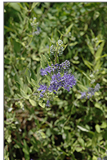
Worcester Gold Caryopteris flowers

Worcester Gold Caryopteris is recommended for the following landscape applications;