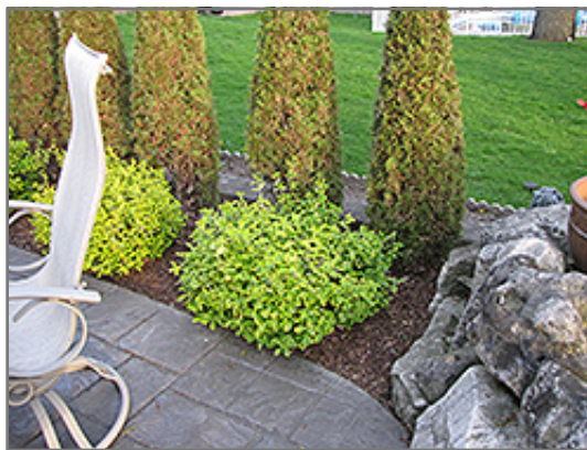
Country Gold Wintercreeper