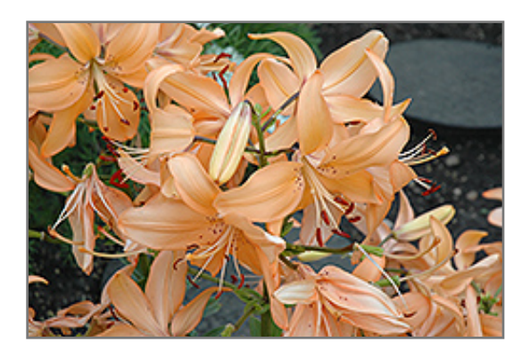
Lisa's Peach Lily flowers