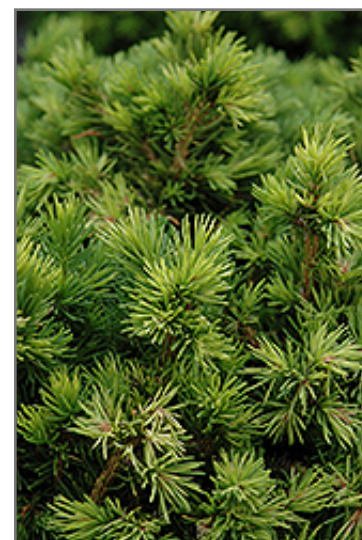
Tompa Dwarf Spruce foliage