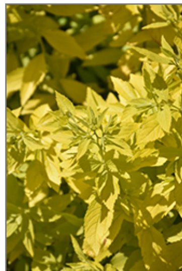
White Gold Spiraea foliage