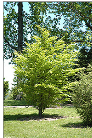
Golden Beech