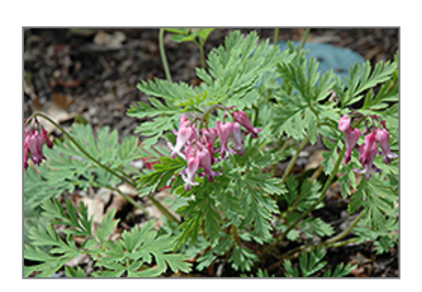
Dolly Sods Bleeding Heart flowers