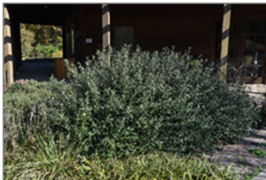
Prague Viburnum