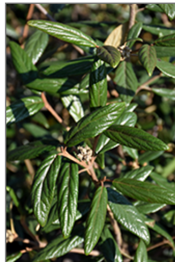
Prague Viburnum foliage

This shrub does best in full sun to partial shade. It prefers to grow in average to moist conditions, and shouldn't be allowed to dry out. It is not particular as to soil type or pH. It is highly tolerant of urban pollution and will even thrive in inner city environments. This particular variety is an interspecific hybrid.