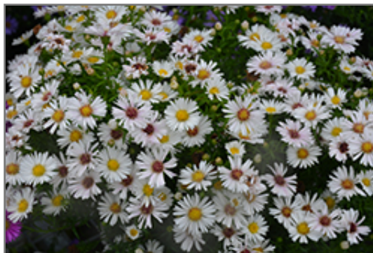
Puff White Aster flowers