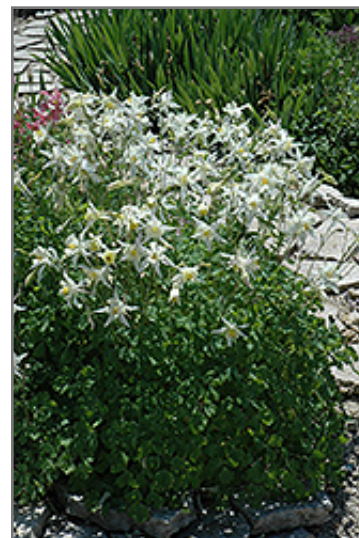
Kristall Columbine in bloom