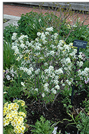
Helvetica Serviceberry in bloom

Helvetica Serviceberry is recommended for the following landscape applications;