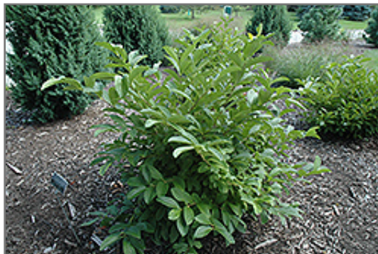
Ironclad Viburnum