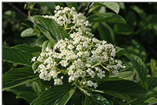
Ironclad Viburnum flowers

Ironclad Viburnum is recommended for the following landscape applications;