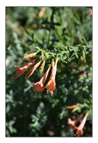
Marin Pink California Fuchsia flowers

8546 Sun Valley Road Anytown, USA 12345 204.782.4147