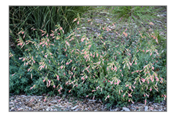
Marin Pink California Fuchsia in bloom

This is a relatively low maintenance plant, and is best cut back to the ground in late winter before active growth resumes. It is a good choice for attracting butterflies and hummingbirds to your yard, but is not particularly attractive to deer who tend to leave it alone in favor of tastier treats. It has no significant negative characteristics.