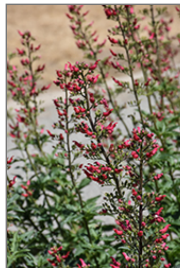
Red Birds In A Tree flowers