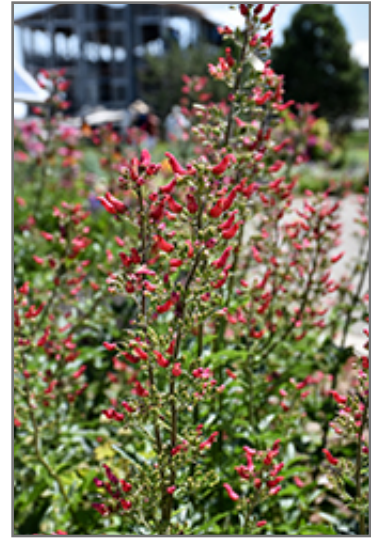
Red Birds In A Tree flowers

Red Birds In A Tree is a fine choice for the garden, but it is also a good selection for planting in outdoor pots and containers. With its upright habit of growth, it is best suited for use as a 'thriller' in the 'spiller-thriller-filler' container combination; plant it near the center of the pot, surrounded by smaller plants and those that spill over the edges. It is even sizeable enough that it can be grown alone in a suitable container. Note that when growing plants in outdoor containers and baskets, they may require more frequent waterings than they would in the yard or garden.