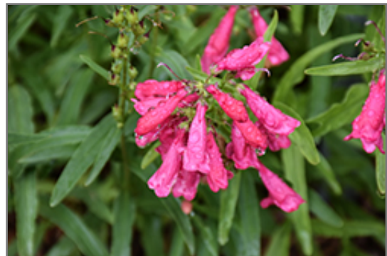
Coral Baby Beardtongue flowers