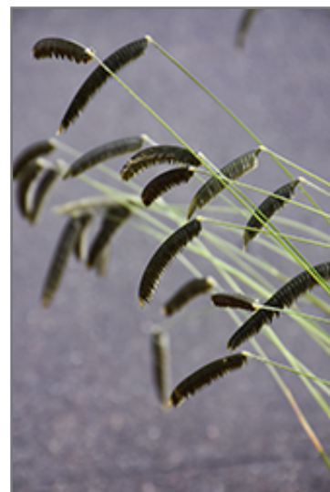
Freeda Compact Black Caterpillar Grass flowers