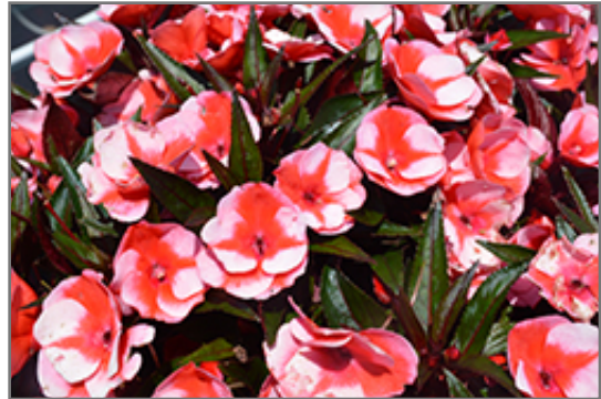
Petticoat Cherry Star New Guinea Impatiens flowers

Petticoat Cherry Star New Guinea Impatiens is recommended for the following landscape applications;