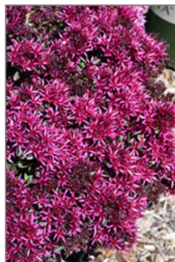
Spot On Deep Rose Stonecrop flowers