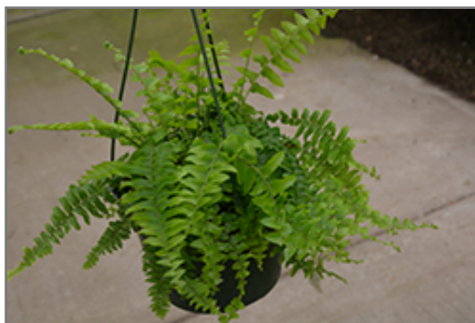
Blue Bell Boston Fern in full

When grown indoors, Blue Bell Boston Fern can be expected to grow to be about 3 feet tall at maturity, with a spread of 4 feet. It grows at a fast rate, and under ideal conditions can be expected to live for approximately 20 years. This houseplant performs well in both bright or indirect sunlight and strong artificial light, and can therefore be situated in almost any well-lit room or location. It does best in average to evenly moist soil, but will not tolerate standing water. The surface of the soil shouldn't be allowed to dry out completely, and so you should expect to water this plant once and possibly even twice each week. Be aware that your particular watering schedule may vary depending on its location in the room, the pot size, plant size and other conditions; if in doubt, ask one of our experts in the store for advice. It will benefit from a regular feeding with a general-purpose fertilizer with every second or third watering. It is not particular as to soil pH, but grows best in rich soil. Contact the store for specific recommendations on pre-mixed potting soil for this plant.