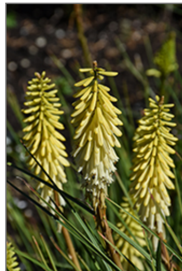
Poco Citron Torchlily flowers

Poco Citron Torchlily is recommended for the following landscape applications;